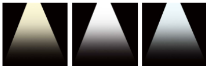
Warm white Pure white Cool white